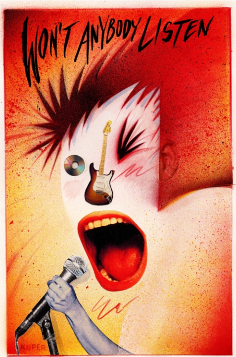
Poster for Won't Anybody Listen created by Peter Kuper. Cartoonist and cover artist for Time , Newsweek , Washington Post , The Nation , and more; see http://www.peterkuper.com

PRESS PHOTOS TO ACCOMPANY PRESS RELEASE DATED JANUARY 17, 2005 LOCATED AT: http://www.anybodylisten.com/press.htm