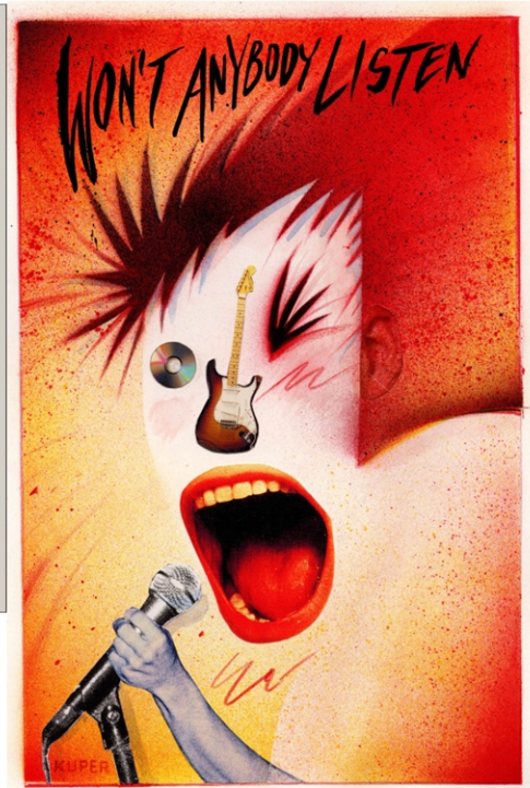
Poster for Won't Anybody Listen created by Peter Kuper. Cartoonist and cover artist for Time , Newsweek , Washington Post , The Nation , and more; see http://www.peterkuper.com

PRESS PHOTOS TO ACCOMPANY PRESS RELEASE DATED JANUARY 17, 2005 LOCATED AT: http://www.anybodylisten.com/press.htm